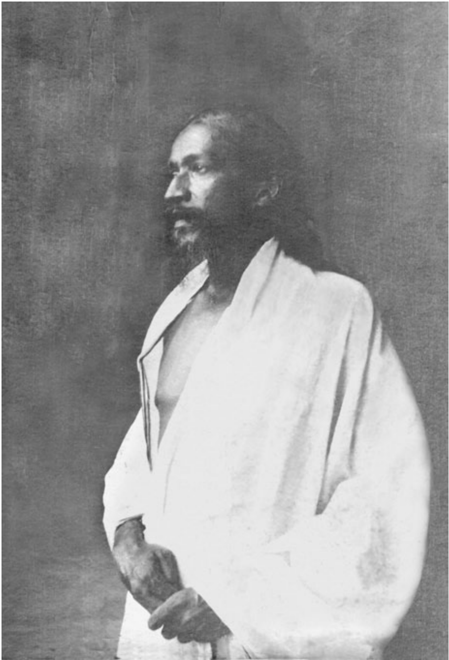
Sri Aurobindo in Pondicherry, c. 1915